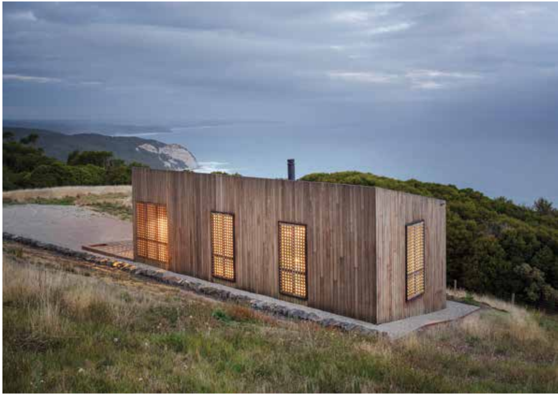
Above Carlton Residence Right South Yarra Residence