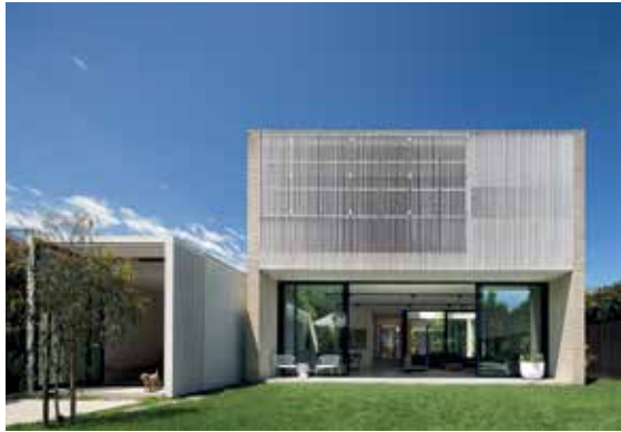
Clockwise from top right Seaview House, Moonlight Cabin, Hiding House